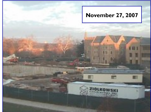
November 27, 2007