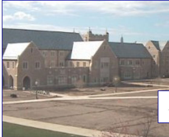
April 15, 2009