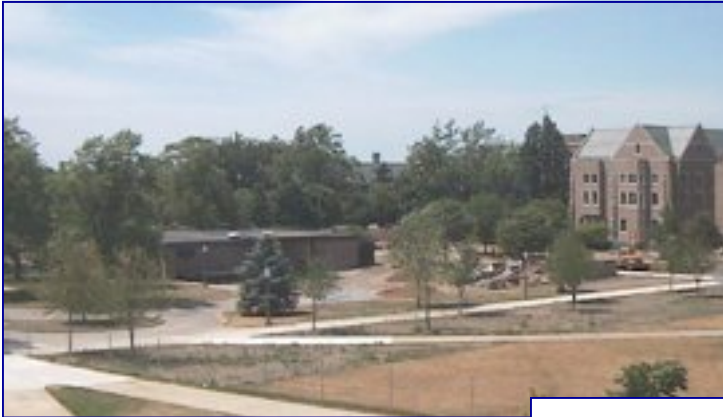
July 3, 2007

Follow the photographs throughout this issue showing what the NDLS has looked like throughout construction! These first two photographs were taken in the summer and fall of 2007, as construction of the Eck Hall of Law was just beginning on the grounds which housed the old post office building.