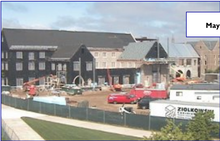
May 12, 2008

AT RIGHT: By spring, much of the exterior had already been finished.