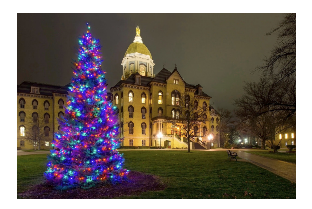
Wednesday - December 6