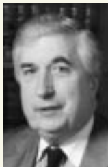
John C. Coffee Jr.