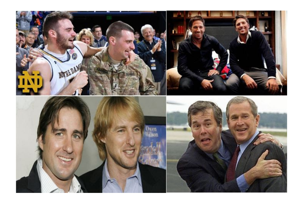
Friday - September 22