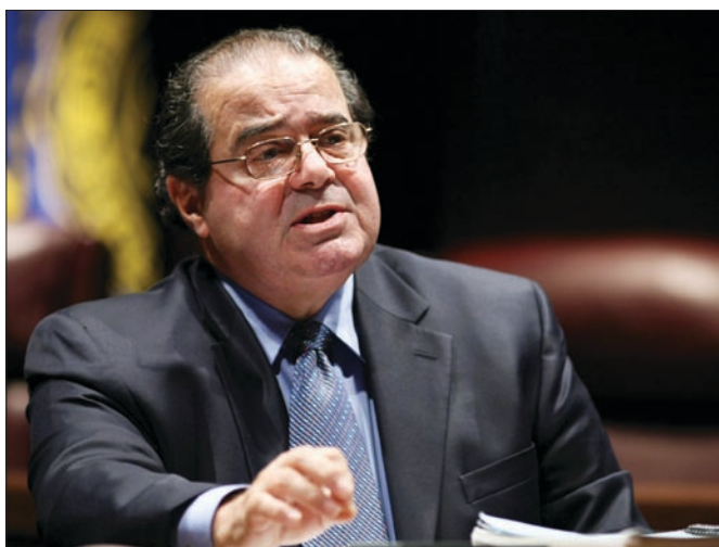
United States Supreme Court Justice Antonin Scalia, speaking at the Law School on Oct. 19, 2007.

Personally, I did not know what to expect from the vaunted Justice's lecture in the morning or the reception in the afternoon—I just felt fortunate enough to obtain tickets for the events through the limited Law School ticket lottery.