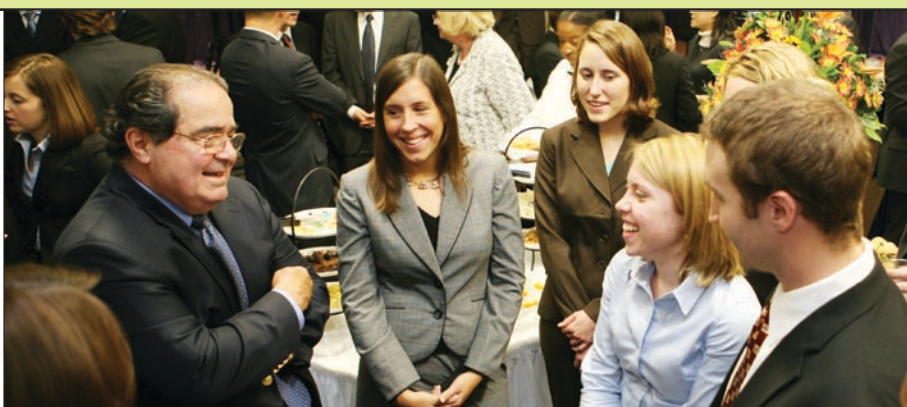
United States Supreme Court Justice Antonin Scalia mingles with students during his visit to the Law School as part of the Notre Dame Law Review -sponsored conference, "Separation of Powers as a Safeguard of Federalism," Oct. 19, 2007.