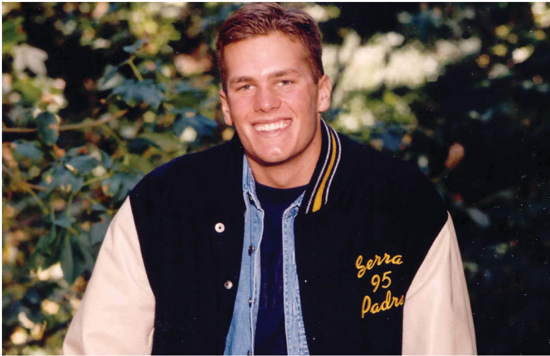
That's Tom Brady.