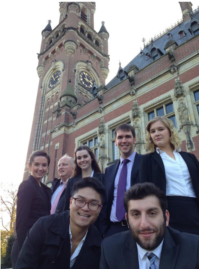
In front of the International Court of Justice at the Peace Palace during the Hague International Institutions Tour