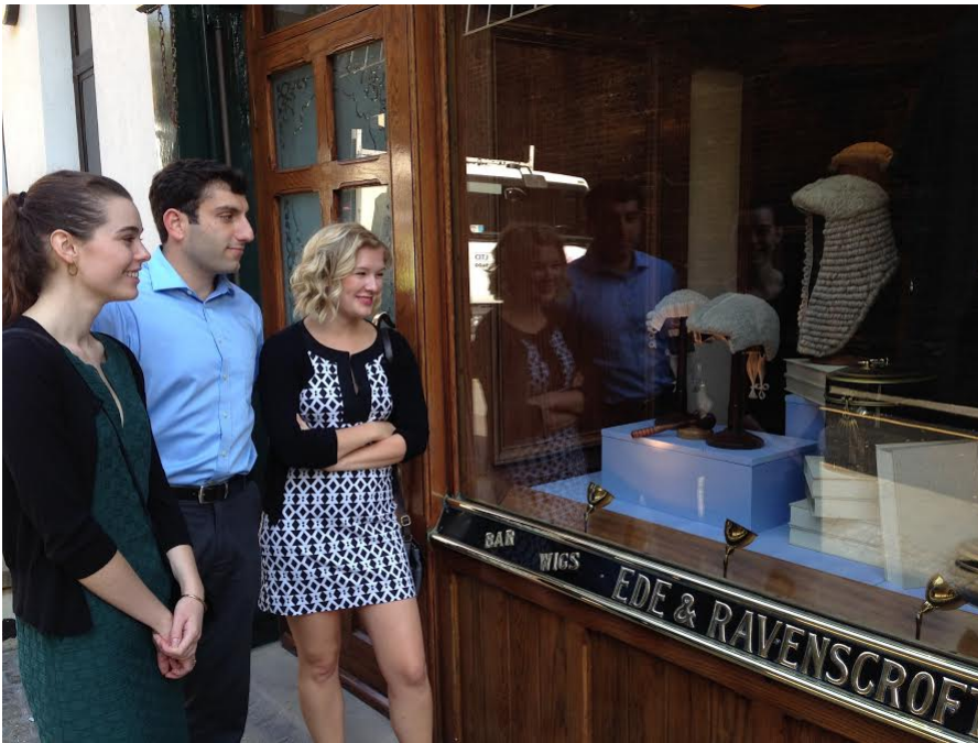
Contemplating a wig purchase during the Legal London Tour Fall 2015