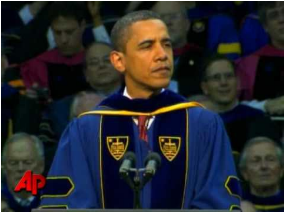
"Wait, what did he just say? I was too busy cleaning my nails."

Looking at his watch..."If these hecklers don't stop I am not going to have time to make it to Mandarin House?"