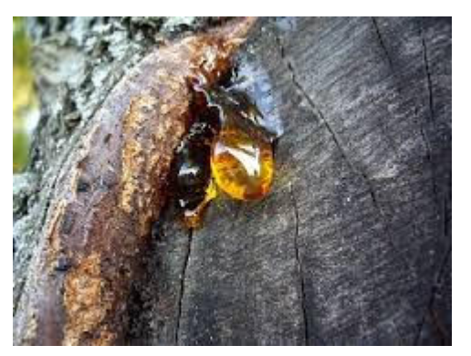
Here comes the sappy!

*On a personal note, thanks for your friendship, now and always.