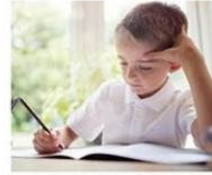
LAST MINUTE LUKE