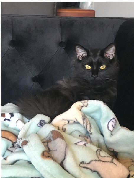
Nermal is an excellent social-distancing practitioner!