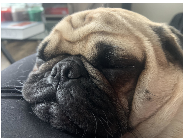
Eugene is an excellent leg warmer while his hooman is in class.