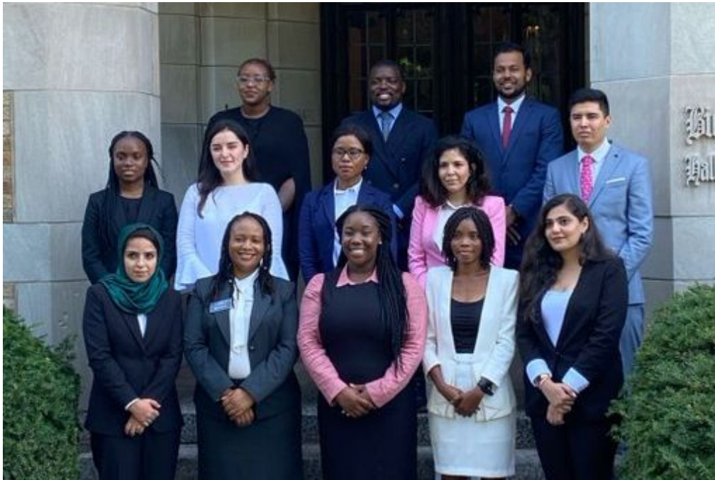
LL.M. Human Rights Students