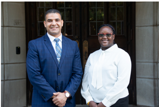
LL.M. at Notre Dame Students