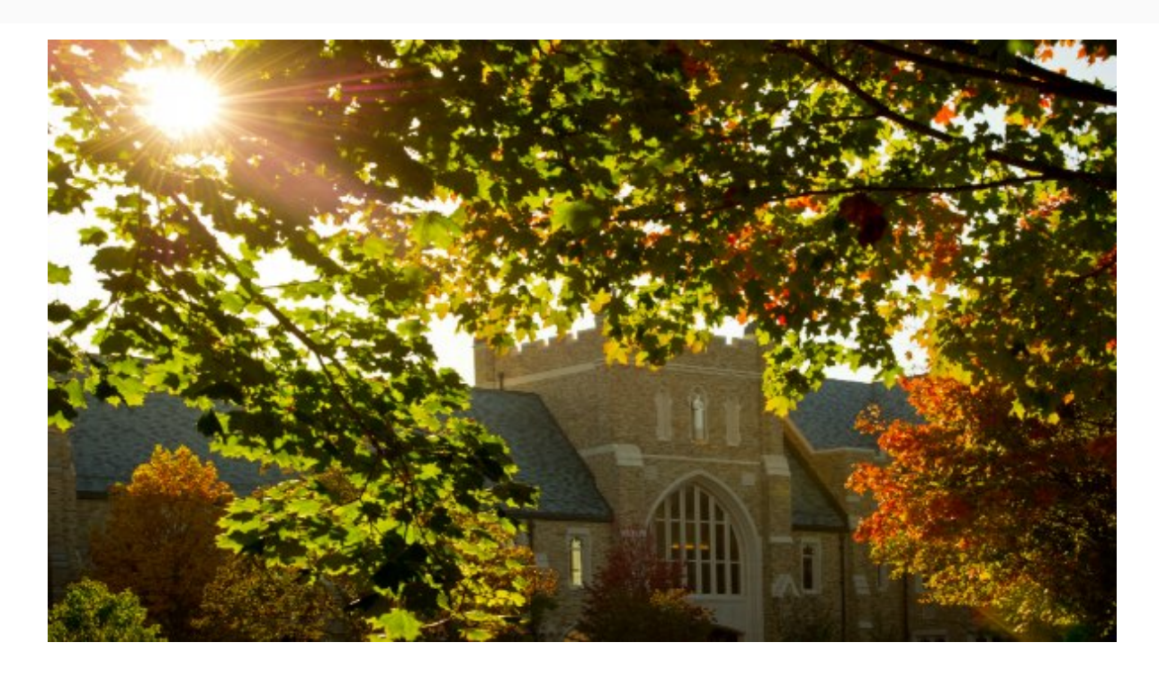
NDLS Communicator Week of 11.8.21

Good morning! Please read below for the latest Law School news and events.