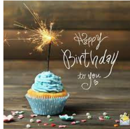
Jim Kelly-May 20

We would like to celebrate your birthday too! We need your permission first, so please fill out the form here .