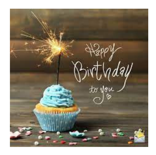
Jaimi Wood--October 8

We would like to celebrate your birthday too! We need your permission first,