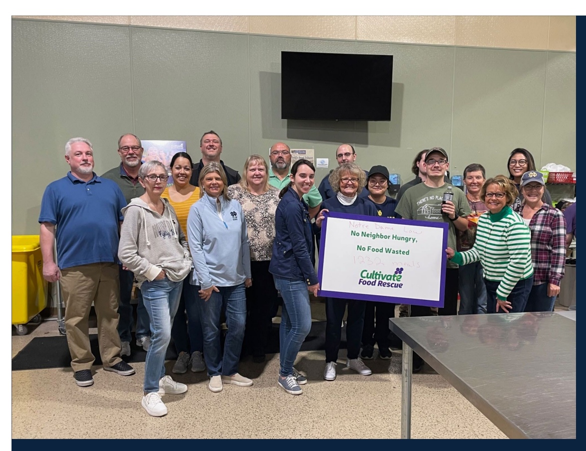
The Administration, IT, and Marketing Communications teams volunteered at