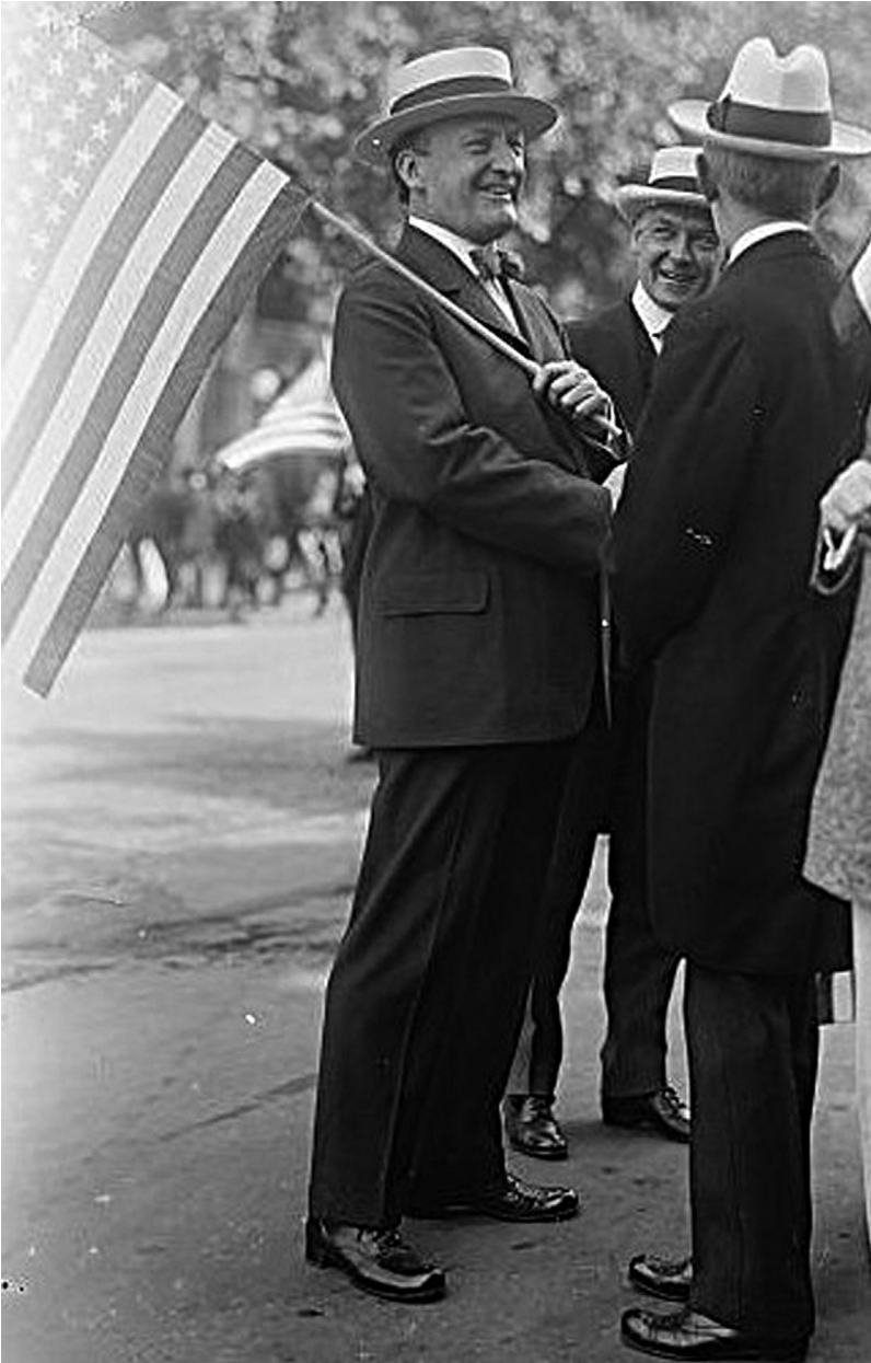
Surprisingly, the notoriously cantankerous and disagreeable Justice James Clark McReynolds (above) was the Justice who most frequently acquiesced in the majority's opinion after dissenting or passing at the conference vote.

At the conference, however, Holmes, Stone, and probably Brandeis disagreed. 69 Patton v. United States 70 confirmed that the jury trial guaranteed to those accused of crime required the unanimous verdict of a panel of twelve jurors, but that this right could be waived by the defendant. The published decision