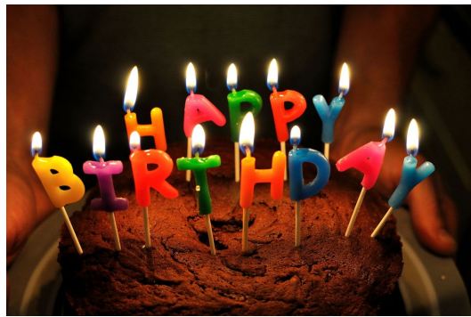
Eileen Varga – April 23

We would like to celebrate your birthday too! We need your permission first, so please fill out the form here .