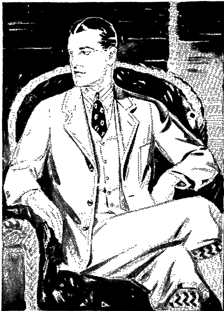
Hickey-Freeman Customized Clothes